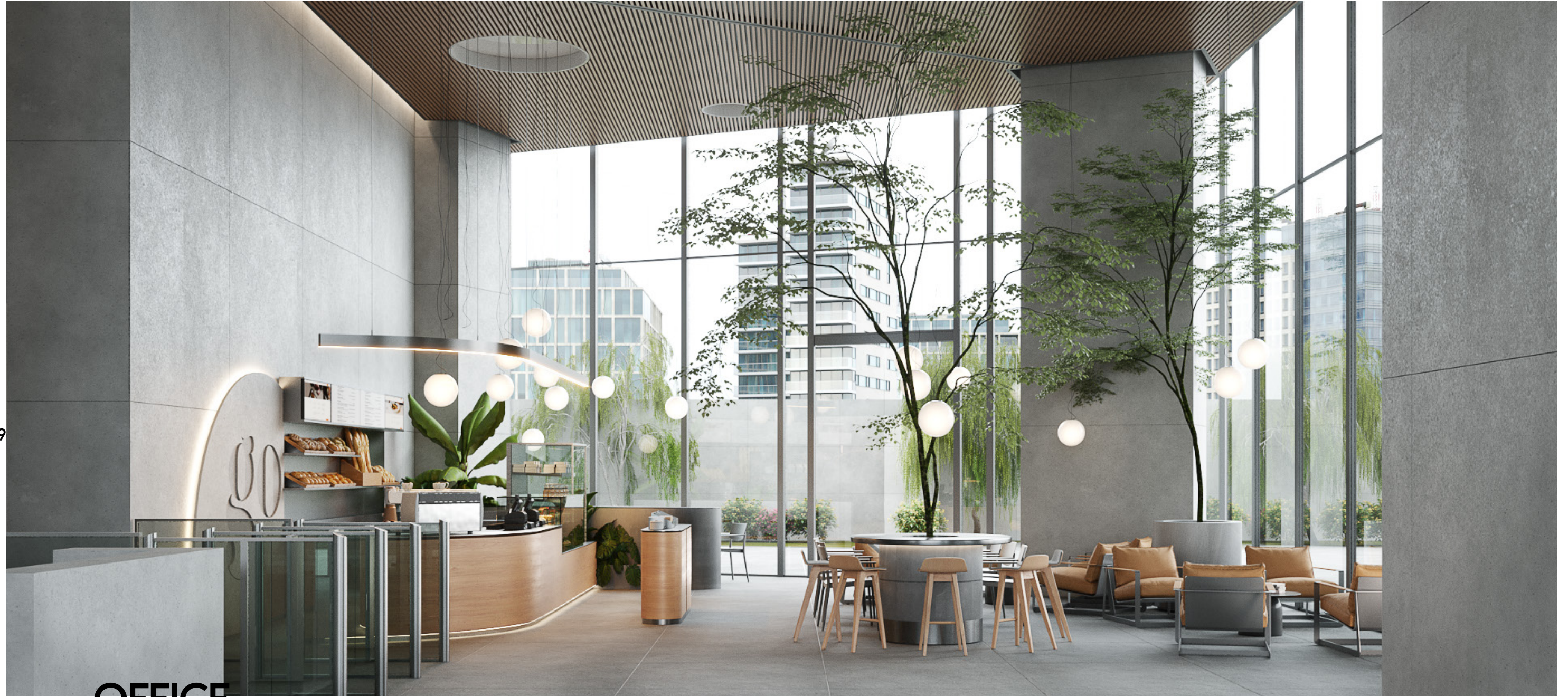
OFFICE MAIN LOBBY